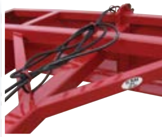
Heavy Duty 6" x 6" frame and tongue construction