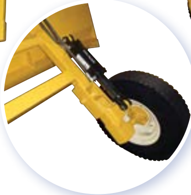
Optional hydraulic tilt allows the scraper to slant for different grades